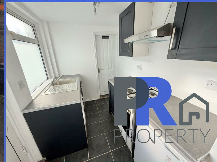
6 Surrey Street, Luton, Bedfordshire, LU1 3BZ £1,350